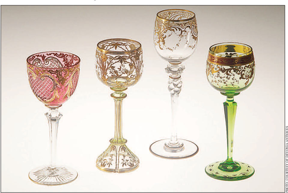
Goblets at Devonia Antiques

The Summer Shack Cookbook by Boston's own Jasper White is a complete guide to shore food. You'll find lots of tips on cooking seafood and some great recipes. This is a must-have cookbook for the foodie who loves seafood.