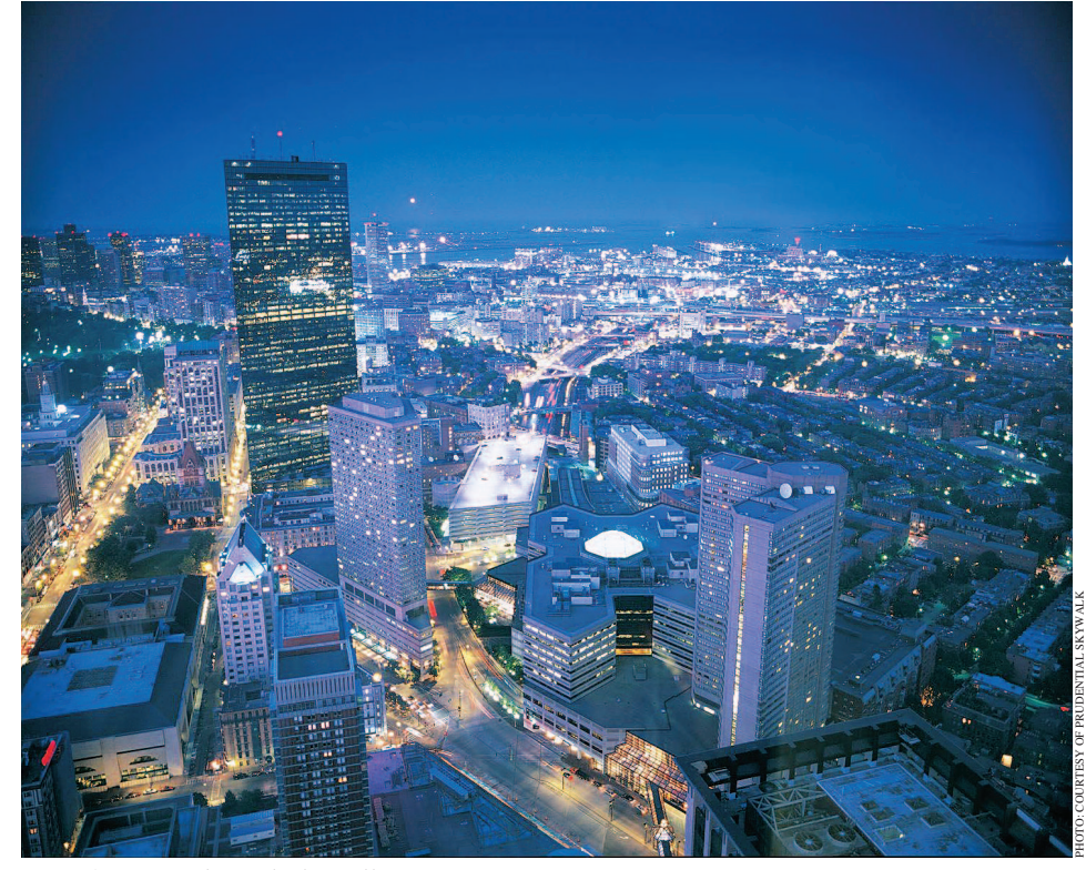
View from Prudential Skywalk

If you're looking for world-class museums, the best restaurants, great theater and historic places, Boston has it all. You just have to get out there and find it. But before you go out and about, familiarize yourself with the local lingo using our dictionary on page 26.