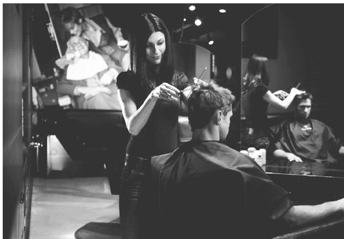
A haircut at Barbershop Lounge