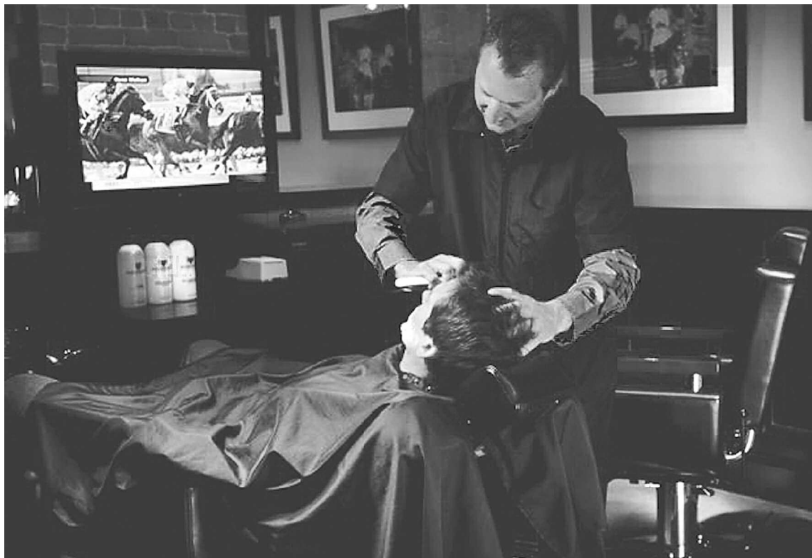
A Barbershop Lounge signature shave

Body waxing has also become hot on the men's list of services. When asked what areas were popular for waxing, Stephanie responded, "We wax anywhere except the face and scalp. We remove hair or shape it depending on the client's wishes. For those private and delicate areas,