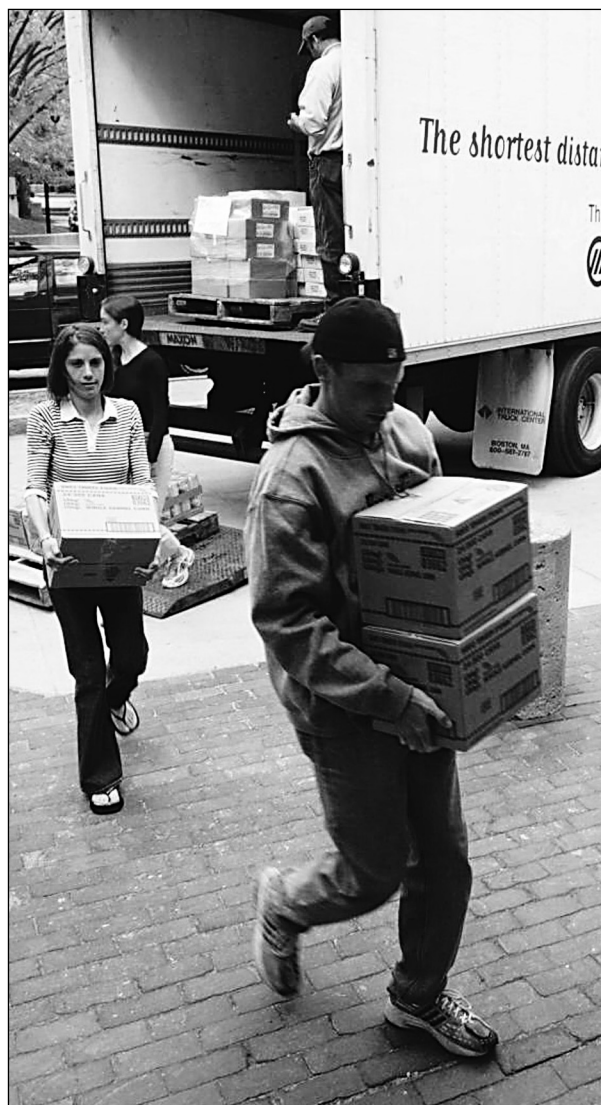
Unloading donated food for the hungry

The Greater Boston Food Bank is the largest hunger-relief organization in New England, and one of the largest food banks in the country distributing nearly 26 million pounds of food annually through its network of more than 600 hunger-relief agencies in eastern Massachusetts.