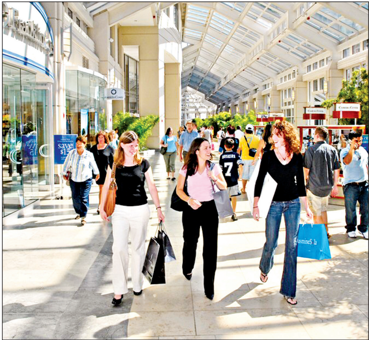
Summer Style Shopping Spree